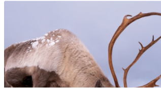
State Veterinarian Issues Animal Import Permit to Support Santa Claus

Mink at affected Oregon farm negative for SARS-CoV-2, wildlife surveillance continues